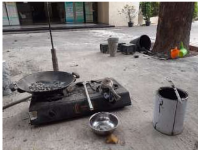
Figure 1. Preparation for Making Test Objects