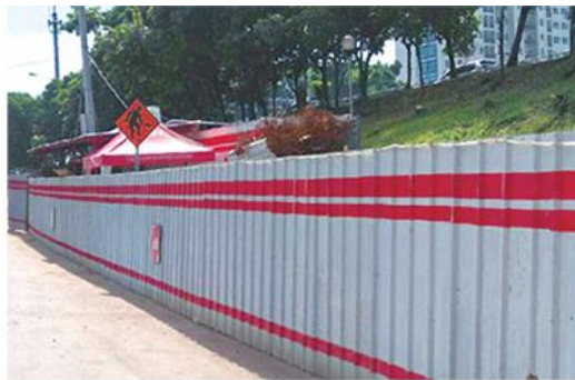
Figure 1. Zincalume Project Fence

The project fence is made of zincalume material with hollow frame. In general this material is used as a roof cover but this material is used as a project fence because the material is easy to obtain and light.