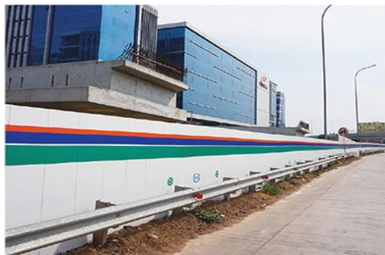
Figure 2. Recycling Project Fence (RFP)

This project fence is made of poly vinyl clorida main material with calcium carbonate mixture as material for strength and reinforcing agent and stabilizer to make RFP not easily broken and fire retardant.