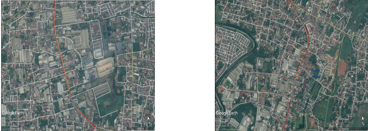
Figure 1. Segment 1 and Segment 2 research locations